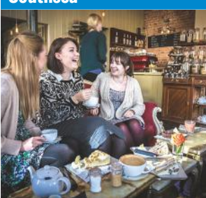
Great range of independent restaurants and bars offering food from across the globe including seafront eateries and fish and chip restaurants.